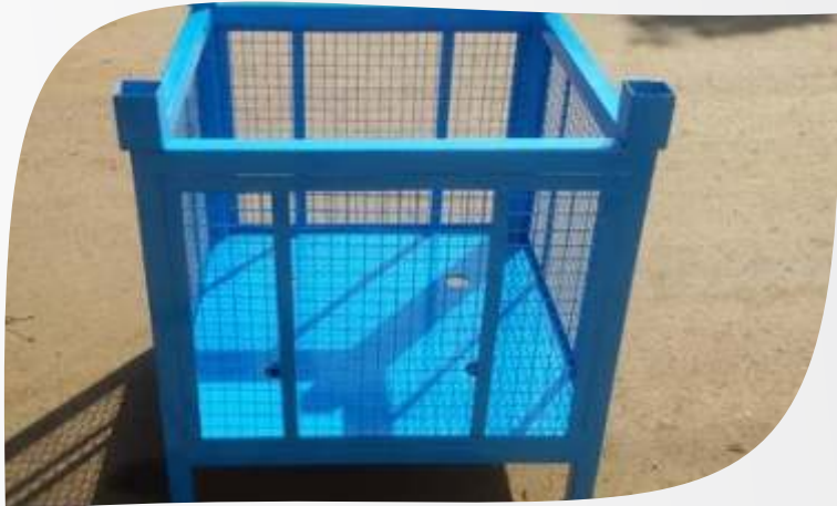
MESH BIN TROLLEY