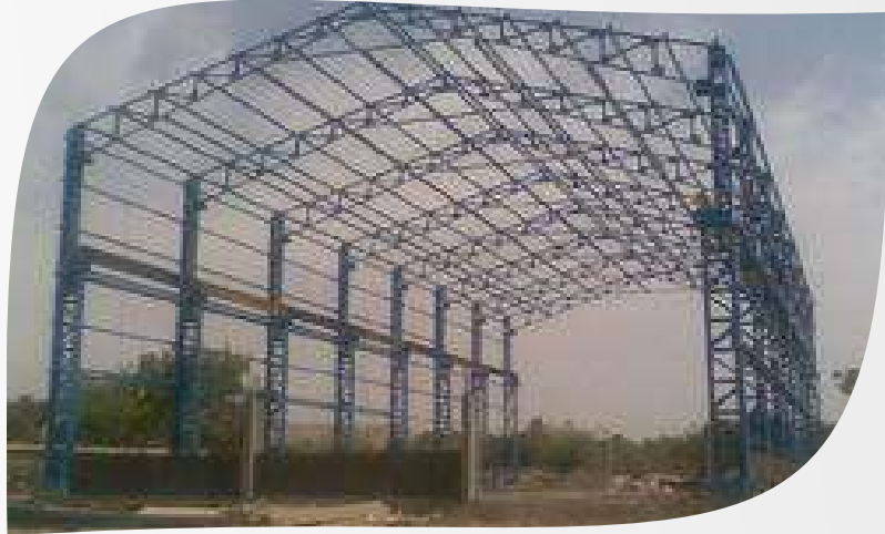
FABRICATION OF INDUSTRIAL SHADES